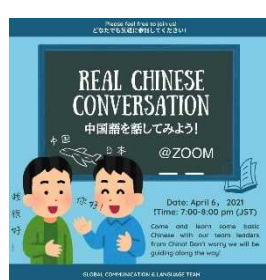
Chinese Talk Cafe