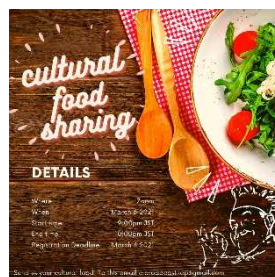
Cultural Food Sharing