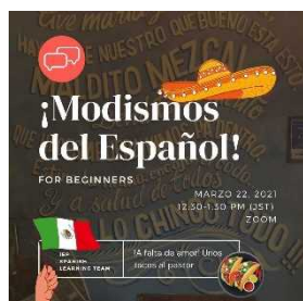
Mexican culture event