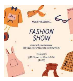
Digital Fashion Show